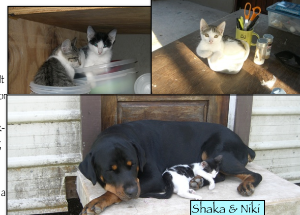
It's a cats life. Well, and a dogs. We finally got some cats to help with controlling the rodents. They have already killed one snake in the dining room. YAHOO!!!